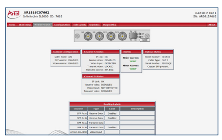
Monitor function module status.